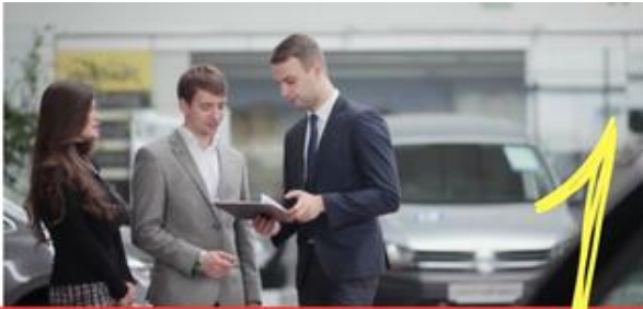
Baseline Risk Audit