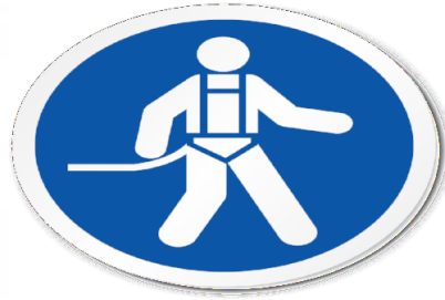
Working at heights