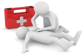
First Aid Level 1