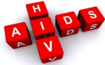
HIV in the Workplace