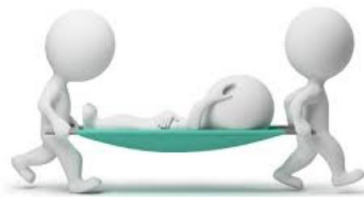
First Aid Refresher