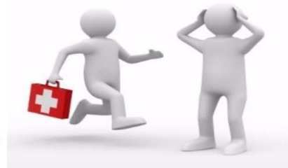
First Aid Level 2 & 3